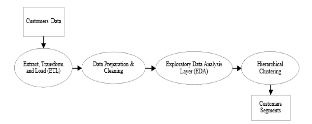
Figure. 1: Customer Segmentation Expert System Dataflow.

This section illustrates the data flow of the proposed customer segmentation component. The component consists of four sequential processes. Figure 1 shows the data flow diagram of the proposed system. The first process is called Extract, Transform, and Load (ETL), which is a separate web application to receive sales transactional data from a user or third-party applications in csv format files. The ETL transforms transactional data into the schema expected by CLIP including the customer features table. The second process is concerned with data preprocessing to do data verification and data cleaning. The third process aims to conduct data aggregations and normalization which make data better fit with the clustering method. Finally, the fourth phase focuses on segments clustering using hierarchical clustering. The input of these models is a customer dataset where the customer is represented by one record as a feature vector. The final output is the customer segments which are stored in a database for further processes.